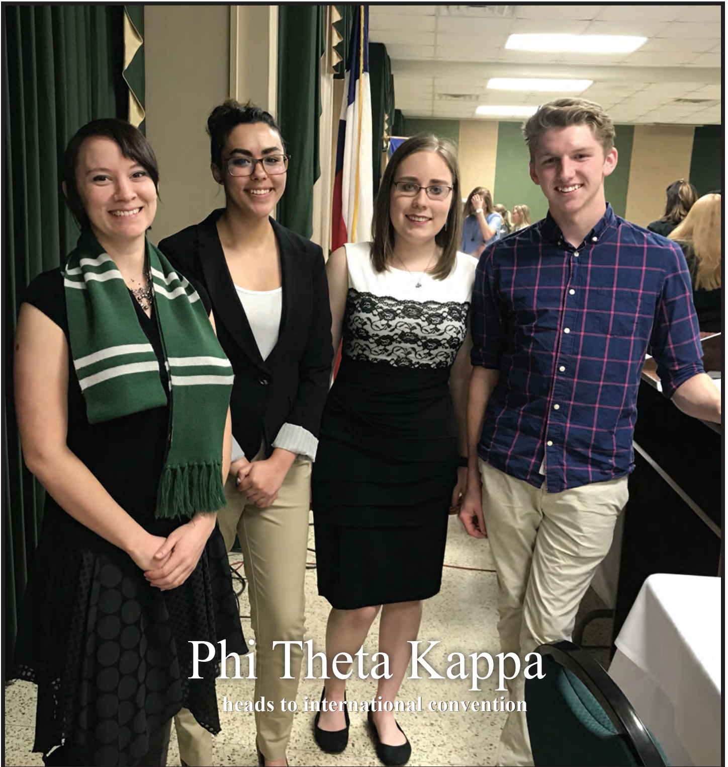
Phi Theta Kappa heads to international convention