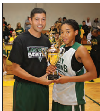
Office of Public Information