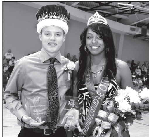
Office of Public Information

Wii gaming tournament will be open to all PJC students on Thursday, Dec. 2 from 10 p.m. to 12:30 a.m. in the library.