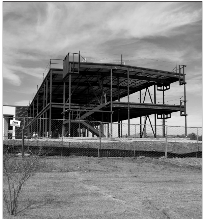
The new South Campus men's wing construction continues on a clear day after severe winter weather.

Eventually, one day, B. E. Masters might be torn