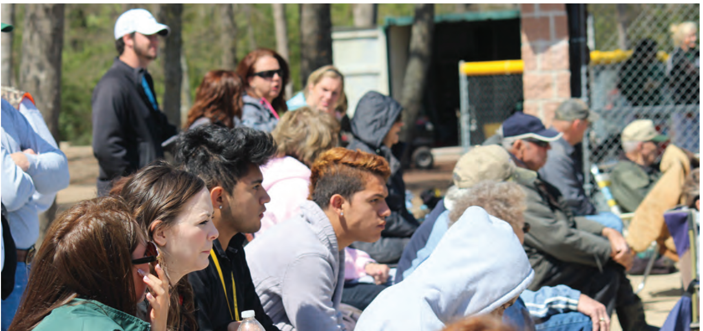
Fans watch the Lady Dragons defeat Navarro College 2-0 on Wednesday, March 27.