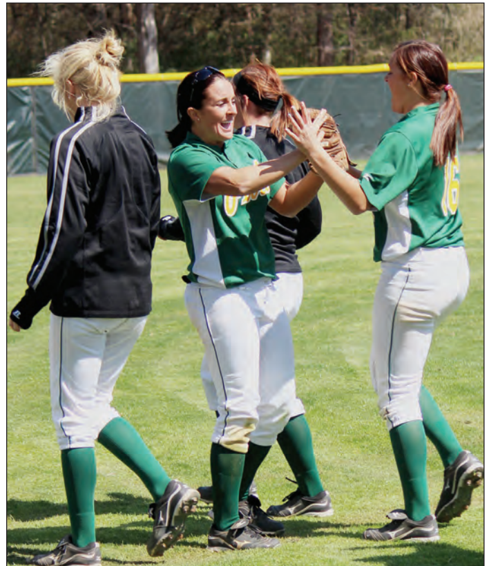
Bo Pruitt/The Bat Players high-five as they run out to left field in celebration after winning the game.