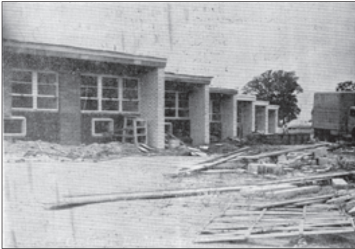
The Bat/September 1957