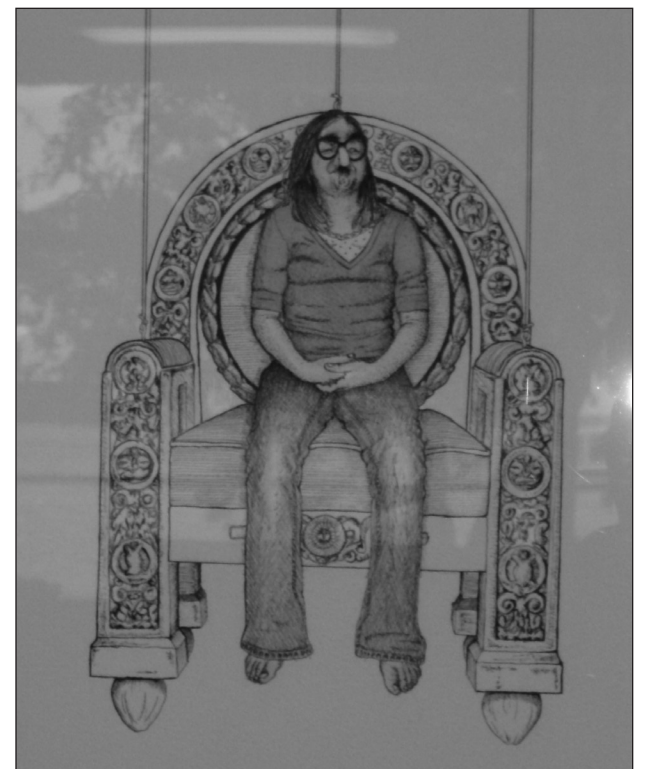
Kelly Shurbet/The Bat