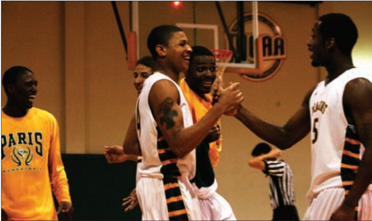
PJC Men's basketball team (left) celebrates with a friendly handshake between teammates after winning the homecoming against Carl Albert Vikings Nov. 12. PJC cheerleaders and Mascot, Pyro (below) cheer on the team during the homecoming game.