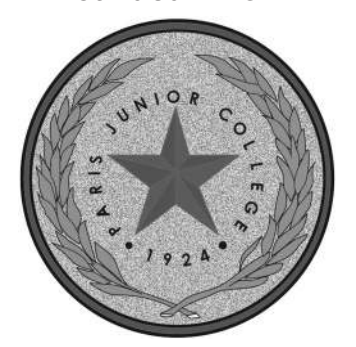
2400 Clarksville Street Paris, Texas 75460

Main: 903.785.7661 • Admissions: 903.782.0425 www.parisjc.edu