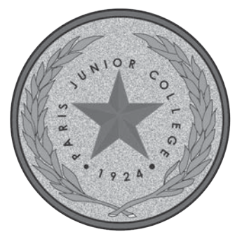
Founded In 1924

2400 Clarksville Street Paris, Texas 75460