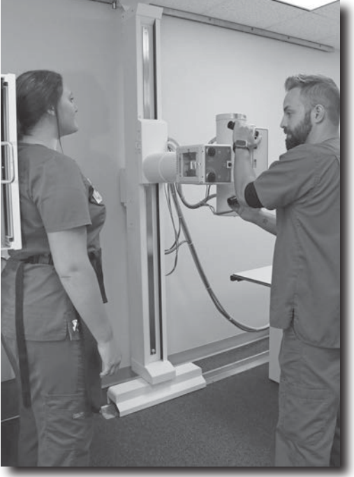
HELPFUL HINT: Applications for the Student must have lived Radiology Technology program are within the district for one accepted annually during the month of

» In-District: Student's residence must be documented on the Paris Junior College tax rolls (defined as residing within Lamar County). year prior to enrollment at September. PJC.