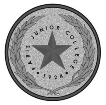
2400 Clarksville Street Paris, Texas 75460

Main: 903.785.7661 • Admissions: 903.782.0425 www.parisjc.edu