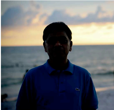
Backlit: Can't see face